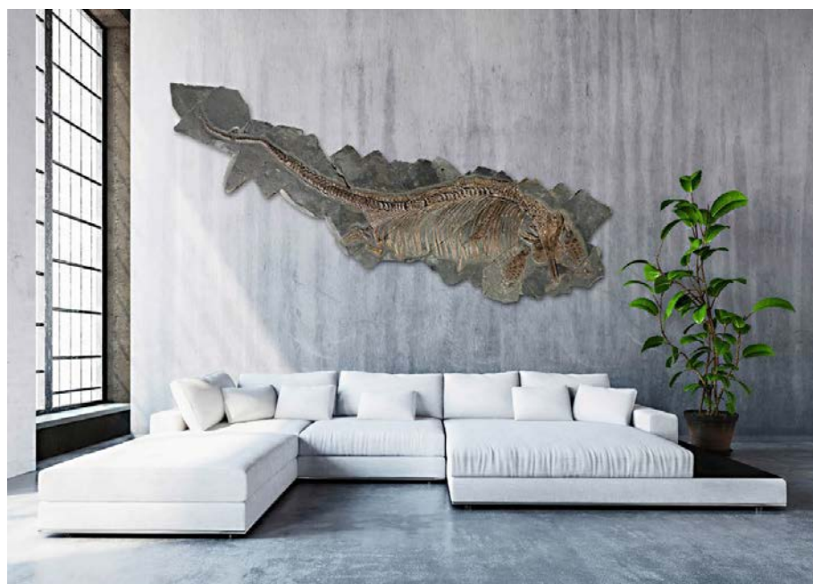
A wide selection of natural history items is available at this year's fair. In addition to various gemstones from dealers such as Provident Jewellery and Robert Procop Exceptional Jewels, Stone Gallery of Holland brings a selection of fossils. Among them is this 180-million-year-old pregnant Ichthyosaur, priced at £1.1m, discovered in South Germany and nicknamed 'Mutti'.