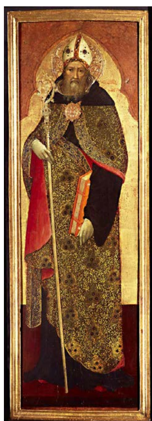
Left: this c.1405 depiction of St Augustine, a prime example of late Gothic painting, is by Nicolò Di Pietro (fl1394-c.1427) completed in tempera and gold on wood panel. It is offered by Maison d'Art of Monaco for $275,000 .