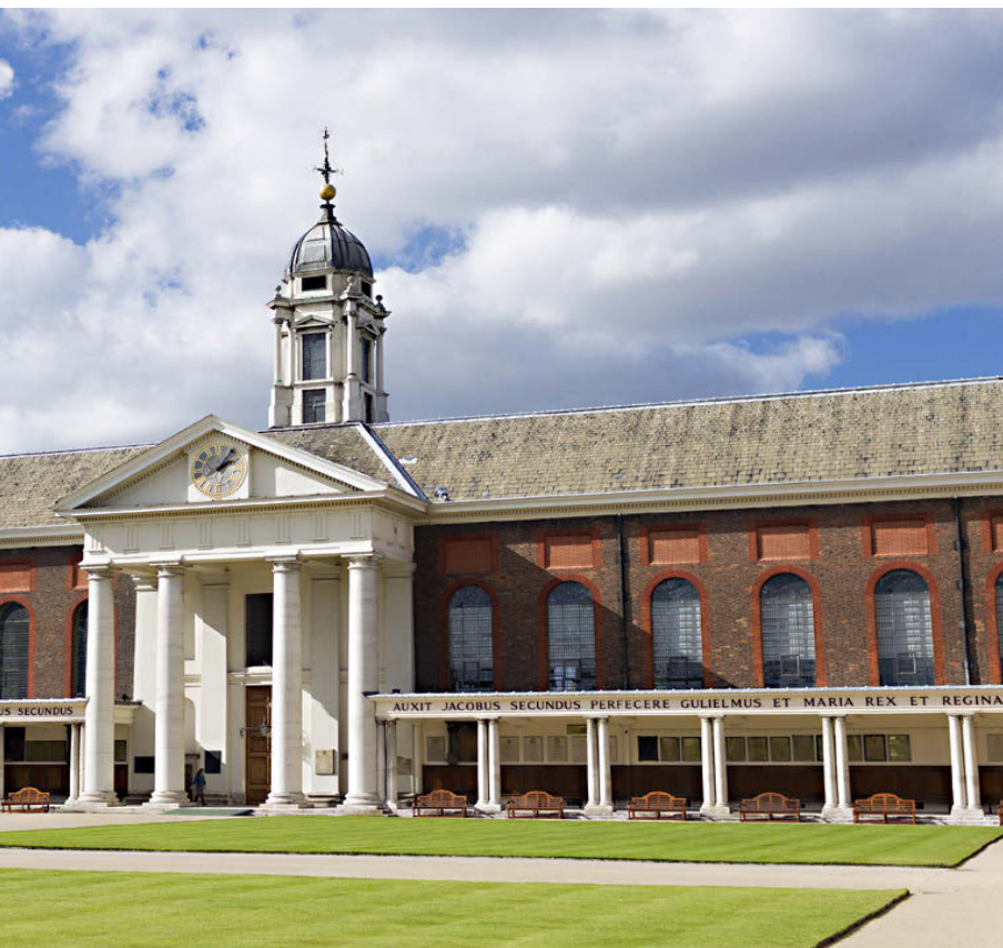
Royal Hospital Chelsea