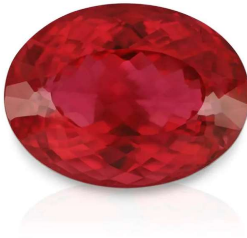
"The Scarlet Red," a 112.68-carat Brazilian rubellite tourmaline being exhibited by Robert Procop at ... [+] TREASURE HOUSE FAIR

One of the highlights of the fair is a collection of eight rare and exceptional unmounted fancy-colored gems of more than 100 carats being billed as "The Great 100-carat Gems" exhibition. The collection is curated by celebrated Beverly Hills private jeweler and gem expert, Robert Procop. They were recently among the gems in a show at the Natural History Museum of Los Angeles County, dedicated to fine gemstones of more than 100 carats.