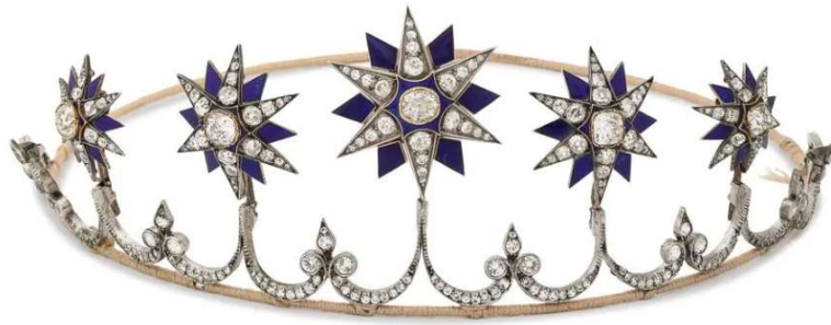
Blue enamel and diamond star tiara on offer from A La Vieille Russie TREASURE HOUSE FAIR

A La Vieille Russie will also exhibit a group of major drawings and sketches by glass and jewelry visionary designer René Lalique (1860-1945). Created between 1894-1910, these unique works made using ink and pencil on