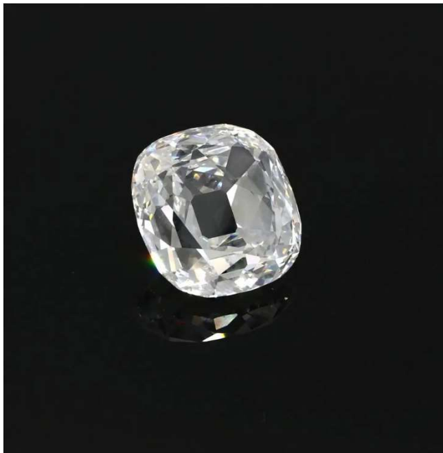
A 100.08-carat, D-color cushion-shaped diamond will be presented by U.S. high jeweler, Provident ... [+] TREASURE HOUSE FAIR

The 100-carat mark isn't limited to colored gems. A 100.08-carat, D-color cushion-shaped diamond will be presented by U.S. high jeweler, Provident Jewelry. The diamond is considered Type IIa, for its chemically pure qualities and exceptional optical transparency. It is a rare category of diamonds comprising less than 2% of all gem diamonds.