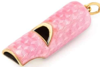
A La Vieille Russie to offer a Fabergé Pink guilloché enamel and gilded silver pendant TREASURE HOUSE FAIR

Two of the world's most renowned Fabergé experts will be among the vintage and antique jewelry dealers at the fair.