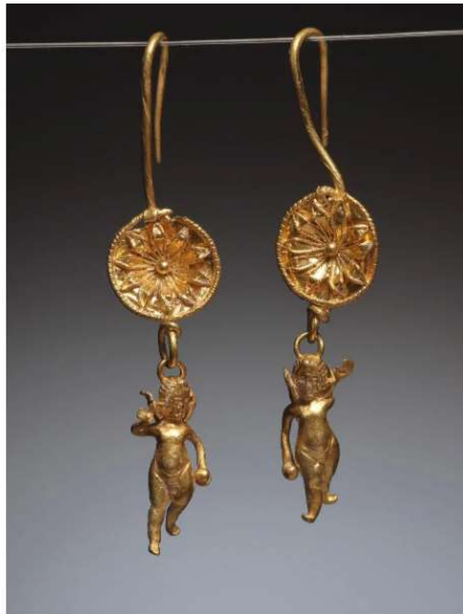
Gold disc earrings with Eros pendants, Hellenistic period, 2nd century B.C. from Cahn TREASURE HOUSE FAIR