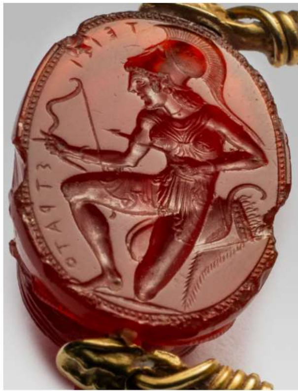
A gold ring with an engraved carnelian, circa early 5th century B.C. offered by Phoenix Ancient Art.