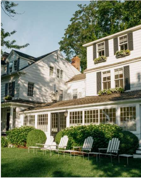
LDV at the Maidstone.

Across the LongHouse Reserve 's bucolic 16 acres, a wonderland of outdoor artworks enliven garden plots bursting with bright green foliage and flowering shrubs. This summer, joining the works by Yoko Ono, Buckminster Fuller, Ai Weiwei, and Daniel Arsham, are more than 100 pieces of Paola Lenti furniture in chic hues of green, turquoise, magenta, and sunny yellow. The vignettes of sofas, armchairs, tables, umbrellas, and poufs occupy glorious spots alongside the pool and pond, as well as in the Breezeway and Pavilion, offering visitors picturesque spots to rest and take in the glorious setting. The furniture brand's eponymous founder selected products harmoniously blend with the art and nature, selecting pieces made using warm woods, like the Giro and Sunset tables, as well as woven Telar chairs and plush Vespucci sofas. "LongHouse is a union of art and nature, with a mission to inspire living with art in all forms," said LongHouse Director Carrie Reborá Barratt. —Jill Sieracki