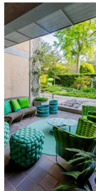
Paola Lenti Harbour sofas, Telar armchairs, and Giro tables with Sciarra tops installed at the Longhouse Reserve breezeway in East Hampton.