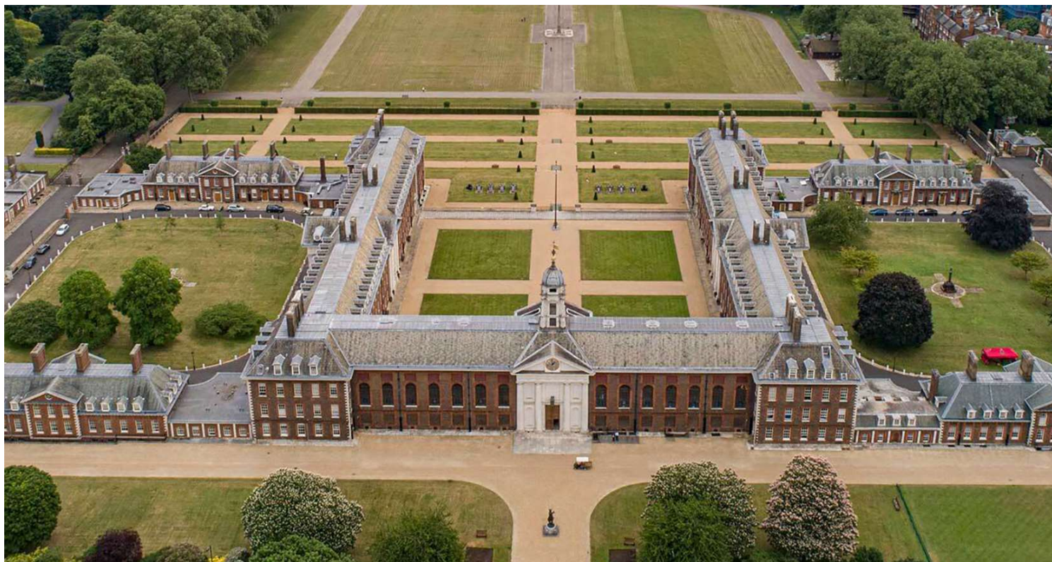
The Royal Hospital in Chelsea.