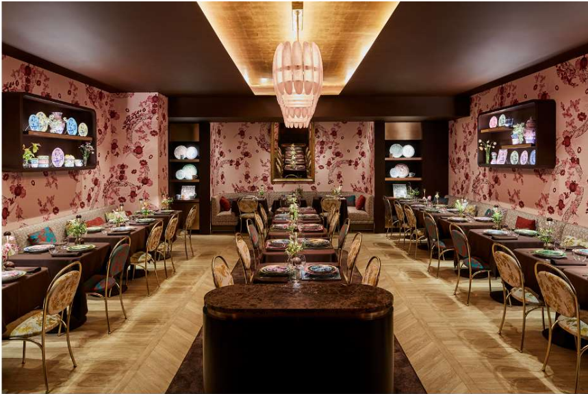
Café Ginori at Bergdorf Goodman.

Located in the historic Royal Hospital Chelsea in London, 70 of the world's top dealers gather to show their finest works, all vetted by independent experts. For six days in late June, the second edition of the fair offers a fascinating mix of art and design. Launched by Thomas Woodham-Smith and Harry Van der Hoorn, the co-founders of the original Masterpiece fair in 2009, the Treasure House concept is positioning itself as a wunderkammer showcasing not only art but fantastic examples of craftsmanship and natural wonders. —Lucy Rees