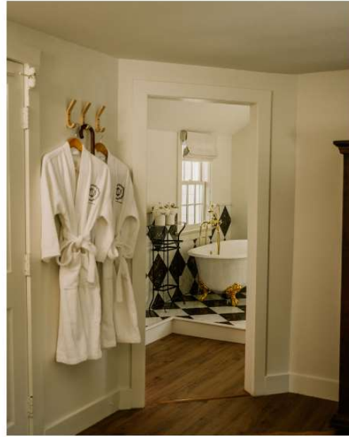
LDV at the Maidstone.