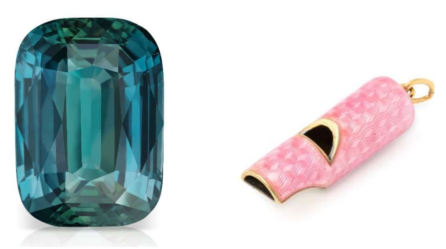
Left: The Miracle, 100.03-carat Tanzanian sapphire - the only teal sapphire in history with such phenomenal colour, clarity and size (Robert Procop). Right: a Fabergé pink guilloché enamel and gilded silver pendant whistle, circa 1910 (A la Vieille Russie)

Royal Hospital Chelsea, London 27 June – 2 July 2024