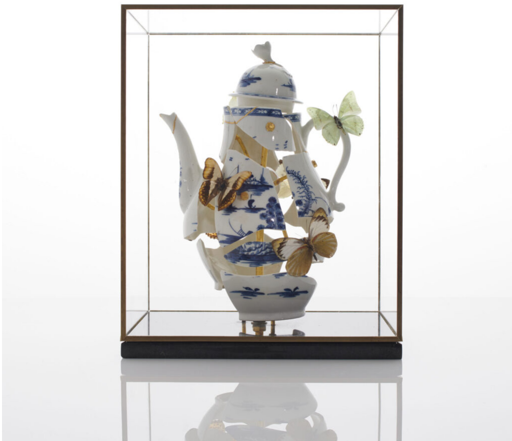
match for the original form