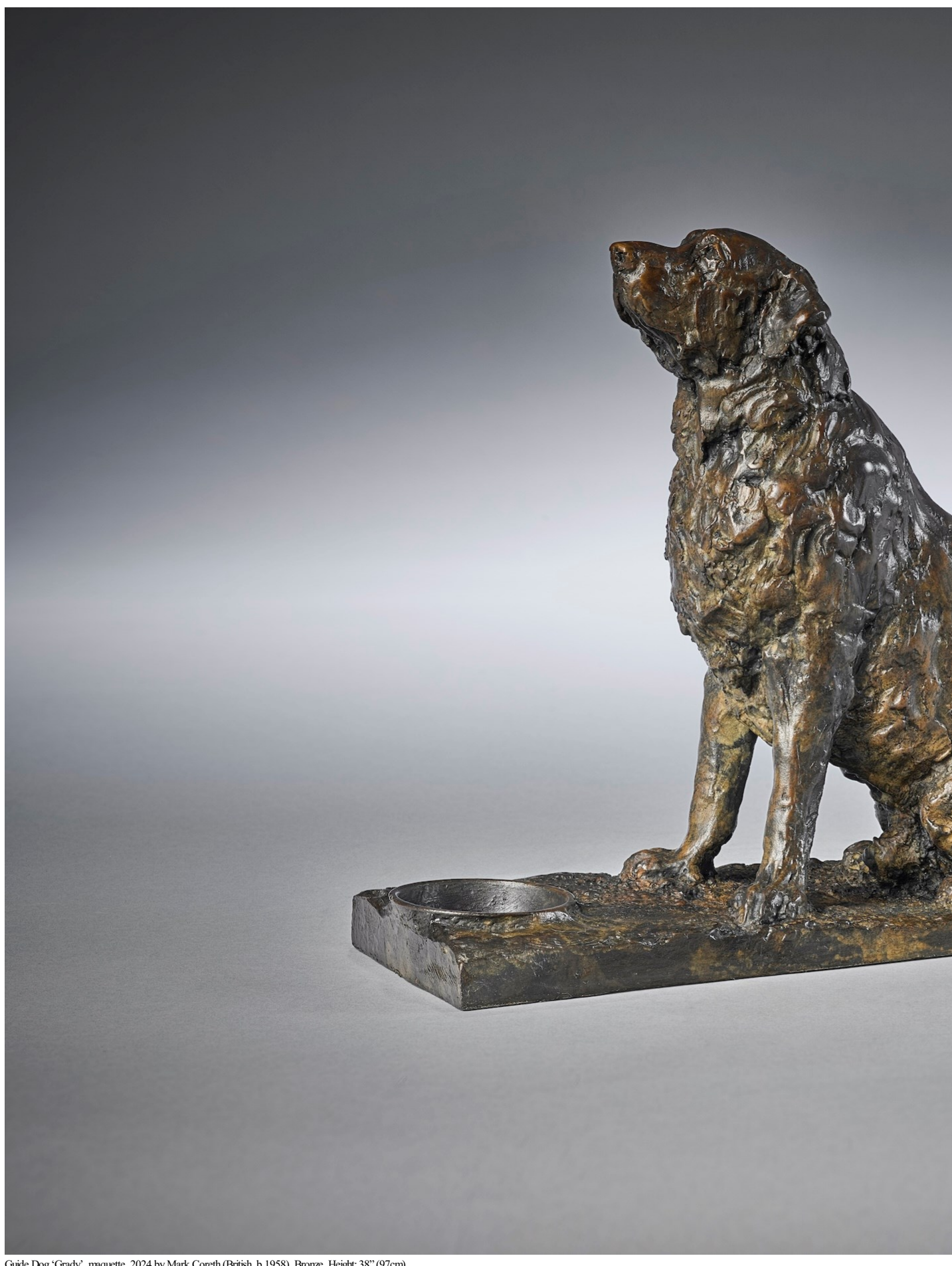
Guide Dog 'Grady', maquette, 2024 by Mark Coreth (British, b.1958), Bronze, Height: 38" (97cm)