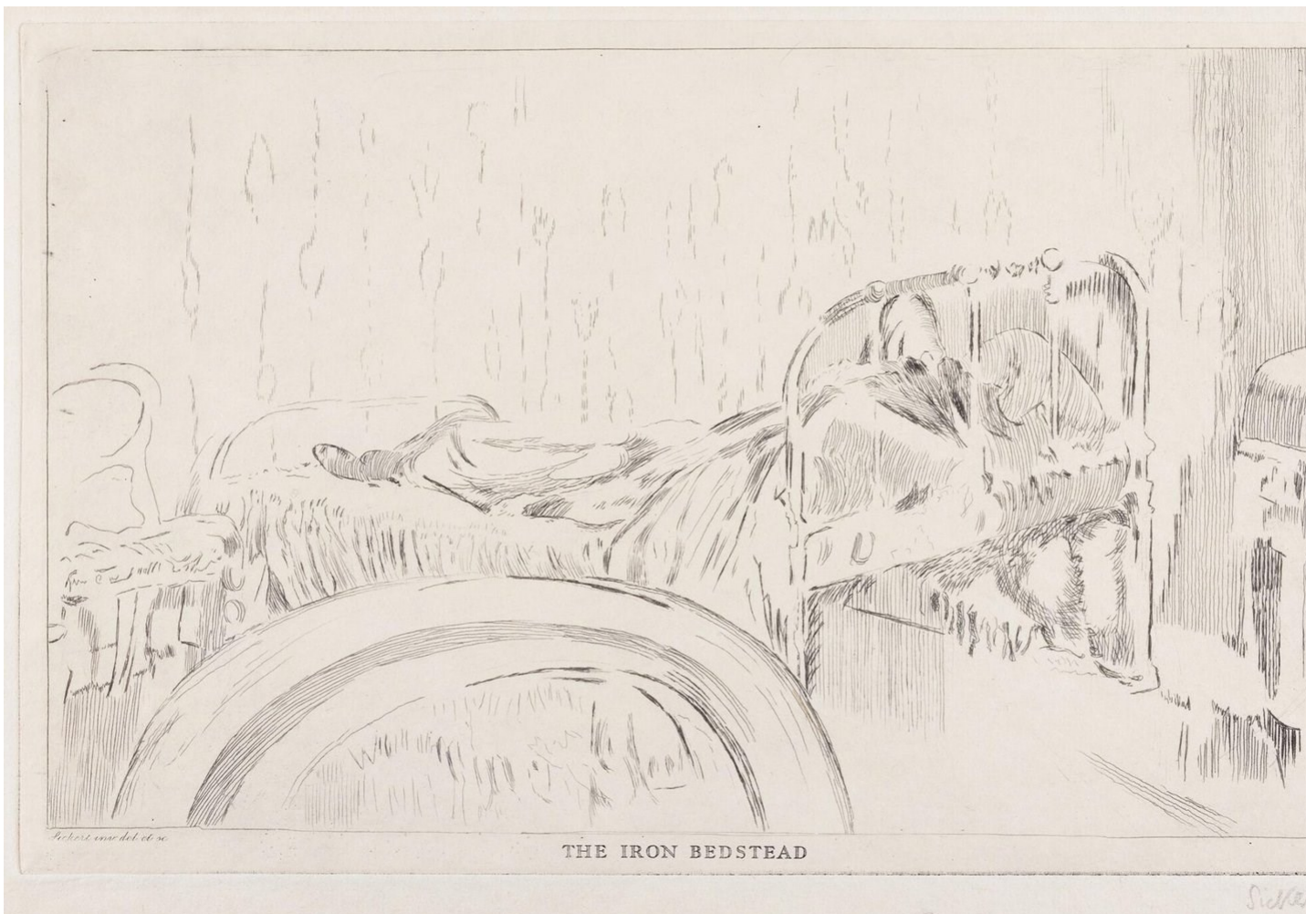
'The Iron Bedstead' by Walker Sickert (1840-1942). Etching. 2nd (final) state. Signed. The first state of this print dates to c.1915 but this, the second state, is probably later. 7x10.5 inches. Available from Abbott and Holder for £1,500.

There is, of course, a caveat to be made about these budget-loving works by famous artists. Whilst they will cost you a fraction of the prices paid by international galleries and billionaire collectors, they are, it must be said, not quite the same as the works you might pay to see in an exhibition. It is Sickert etchings, not oil paintings which come up for sale at such appealing prices. And it is Matisse lithographs, linocuts, and posters which are available to purchase for the same price as return flights to somewhere exotic, rather than his more famous paintings and collages.