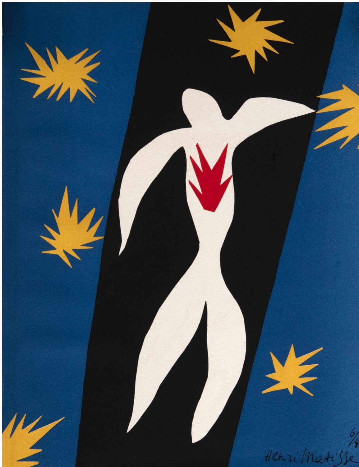
The Fall of Icarus by Henri Matisse. Lithograph, 1943, Signed in plate. 26.5 x 35.5 cm Available from Goldmark Gallery for £2,250

Francesca Peacock is an art, books, and culture writer.