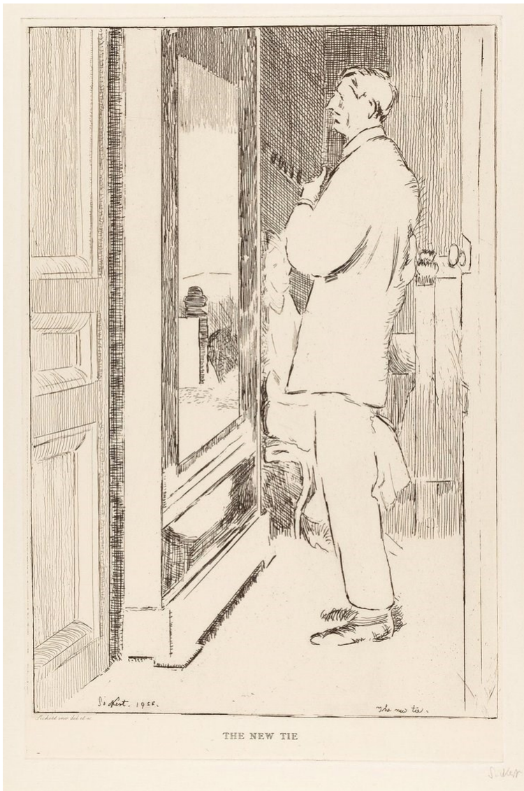
'The New Tie' by Walter Sickert (1840-1942). Etching. Second (final) state. Signed. 1922. Signed, titled and dated in the plate. 10.5x6.75 inches. Available from Abbott and Holder for £1,500.